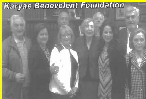
The nine Trustees

On October 14, 1965, the US Treasury Department, Internal Revenue Service, issued a ruling the Foundation is exempt from Federal Income Tax as an organization described in section 501. The trustees can accept gifts, devices and bequest. These are tax-deductible contributions. The Foundation accepts and appreciates money contributions from all Arachovitans-Karyates worldwide. Management and administration of all aspects of the trust (Foundation) and its properties are the responsibility of nine trustees who are elected by ADELPHOTIS BOARD OF DIRECTORS, while the approval of school scholarships is made by an another independent five-member committee.