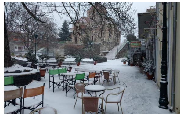
The Karyes main square full of snow