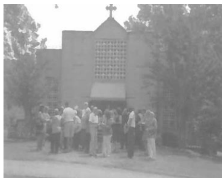
The Church service