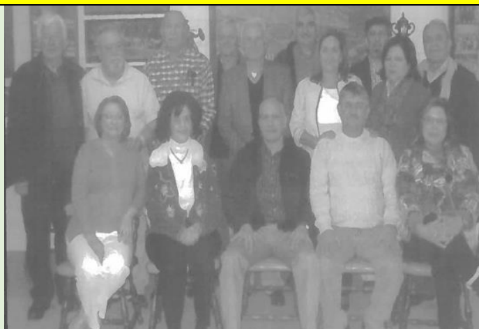
Photo of the previous season Board of Directors and Officers (2015-16)

The Karyates Association wish at all the members of the Board of Directors to succeed at their work and states that they will always be at their disposal.