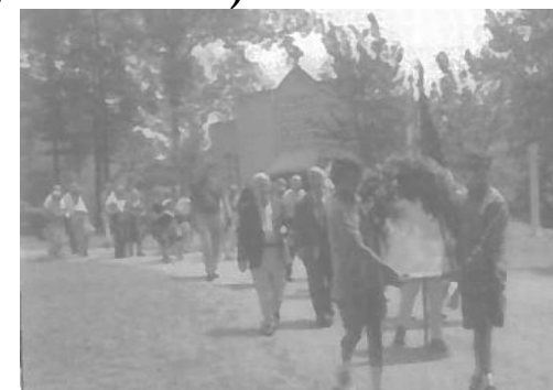
Holding the Holy Icon