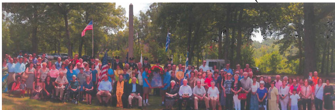
The commemorative photograph